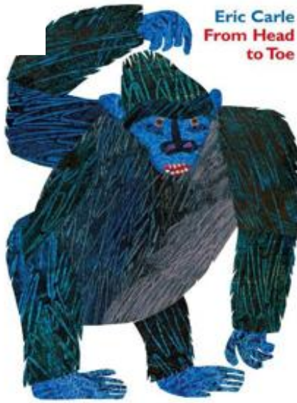
Eric Carle From Head to Toe