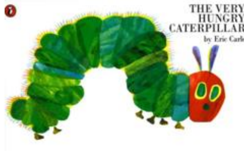
THE VERY HUNGRY CATERPILLAR by Eric Carle